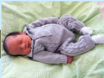
Melissa Morones Welcomes Baby No. 2 Born: November 28, 2011 Weighing in at : 6 lbs. 10 oz.